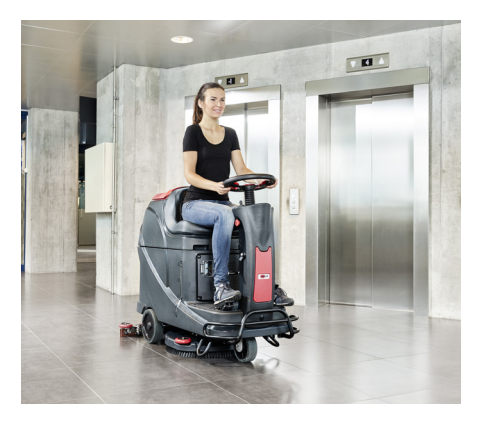
Comfortable with a minimum of training