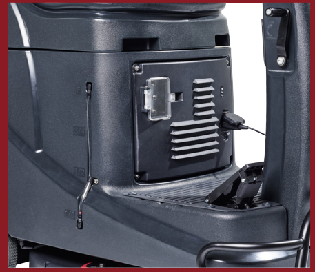
An integrated on-board charger enables easy plug-in and battery charge at any outlet