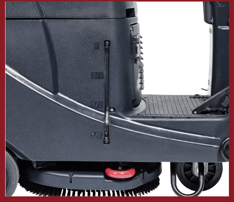
Water solution level indicator with volume visible on the tank