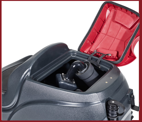
Large opening to the 73 liter recovery tank allows easy cleaning