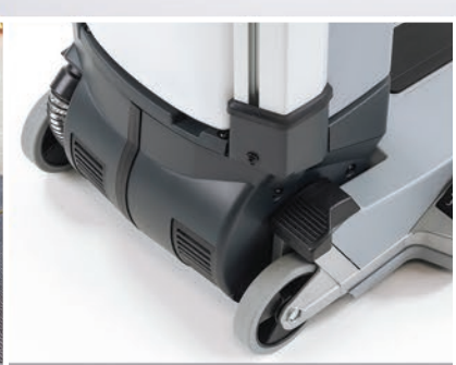
Machine functions stop when in the upright position.