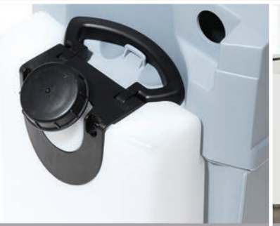
Solution tank dispenses only clean solution unlike a traditional mop-and-bucket.