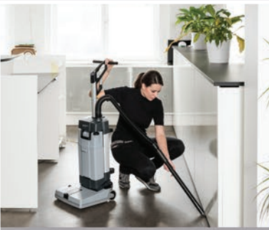
Optional manual suction hose offers the ability to reach less accessible areas.