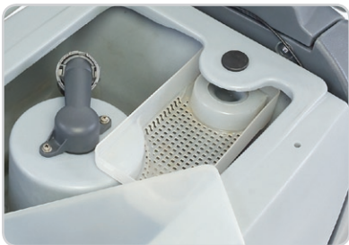
An integrated debris catch cage traps and collects drain clogging debris.