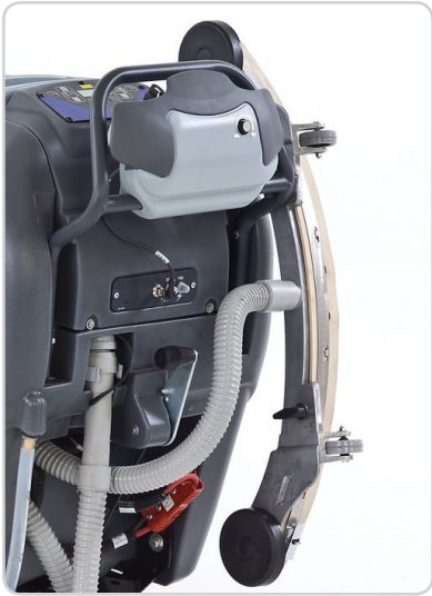
A built-in squeegee hanger makes transport easier and reduces trip and fall accidents.