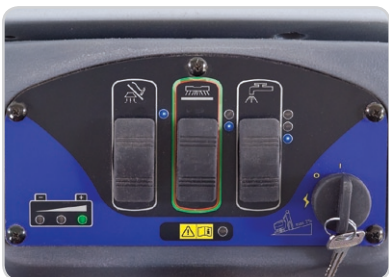
The ST 26 inch disc model – provides simple operation and robust scrubbing controls.